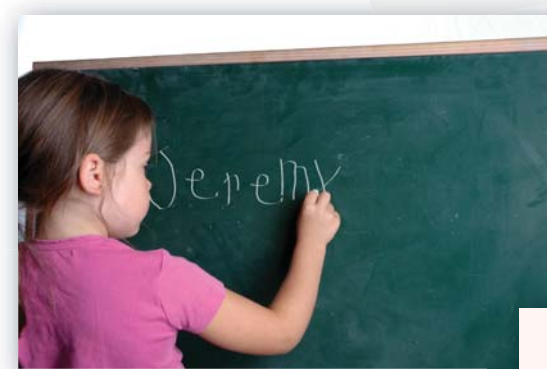
1-12 Years Old

5 Personalized Pictures created for specific age groups