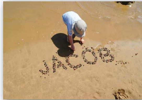
1-12 Years Old

5 Personalized Pictures created for specific age groups