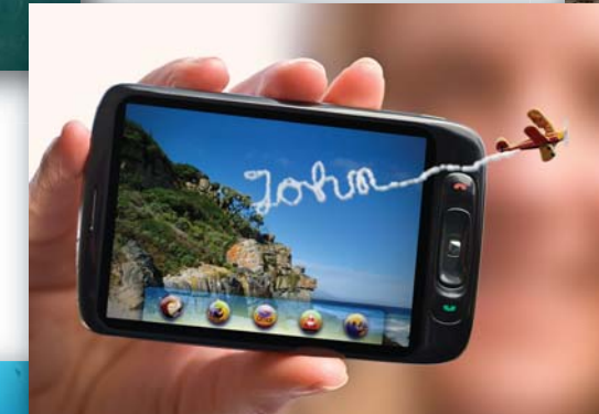
21-44 Years Old