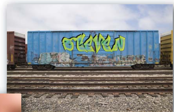
13-20 Years Old