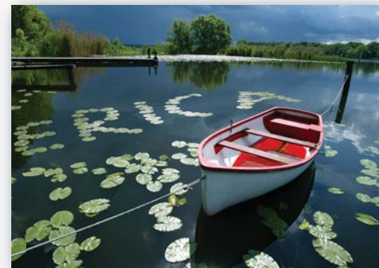
65 Years or Older