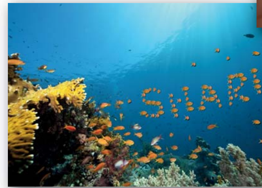
45-64 Years Old