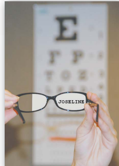
45-64 Years Old