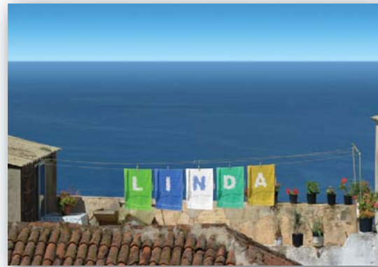
13-20 Years Old