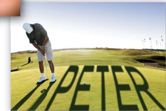
65 Years or Older